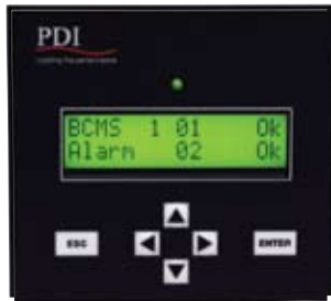
WaveStar™ 8212 local monitor