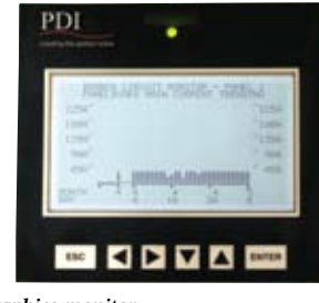
WaveStar™ graphics monitor