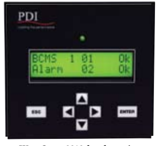
WaveStar™ 8212 local monitor